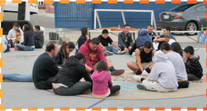
Small groups reflect on what the day has been for them.