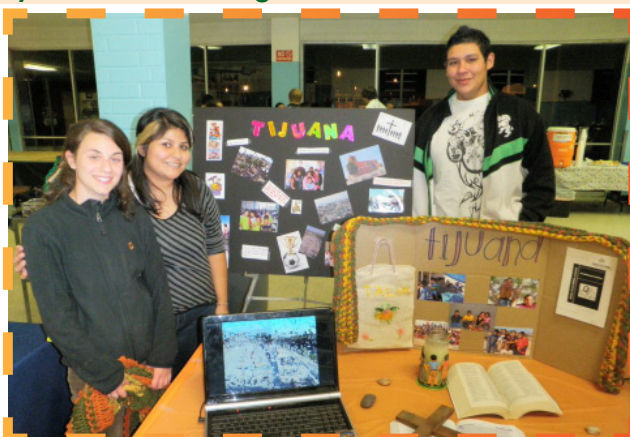
Tijuana Volunteers ready to share their stories

This was followed by a question and answer session with the missionaries. They were very open