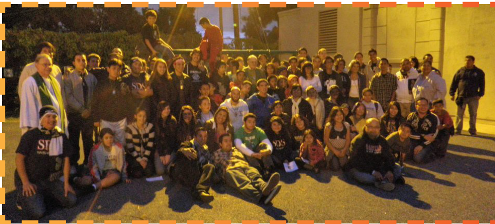
Salesian Missionaries gather for a family picture at the end of the day.

Profound examples of service can be found throughout the world but few events call together such a varied and spiritually charged group of individuals as was the case with the Salesian Mission Day 2011. Children, teens, adults, religious, Lay missionaries, volunteers- all were joined together in love of God to serve His people in any capacity, small or profound. Whether it was pulling weeds, mopping floors, moving furniture, or simply picking up trash in the neighborhood around the Wabash Boys and Girls Club, young people poured forth their hearts in the collective effort to be missionaries to their own people.