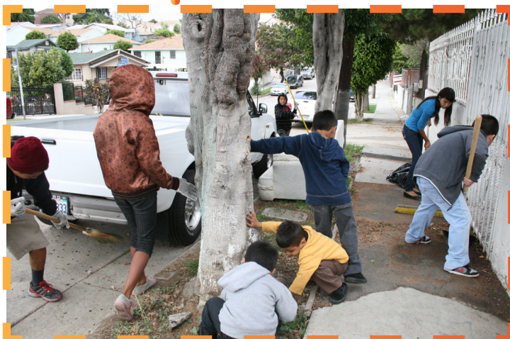
Everybody does something to serve.

On Salesian Mission Day 2011 several youth came together to help out and make a difference, which would not only make an impact in the lives of whom they were helping but in their own. I decided to take part in something of which I did not know what to expect or