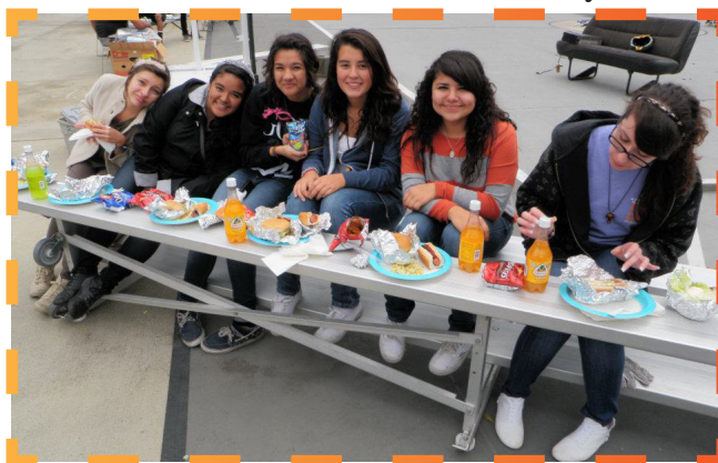
Lunch revived the energies of all who served.

I learned that in such a community it is good to interact with the people in the neighborhood, that more than how much we get done, it is about being present with the people, so that’s what we did. In a day or two